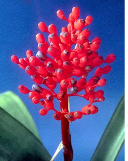
Aechmea miniata inflorescence

tessmannii which have included sepals. Also: chantinii's floral bracts are strongly nerved and lepidote; zebrina's are even and only obscurely punctulatelepidote; tessmannii's floral bracts are even and lustrous. Also: chantinii's primary bracts shorten abruptly toward the apex while tessmannii's diminish evenly; tessmannii's rhachis is flattened but chantinii's and zebrina's excavated.