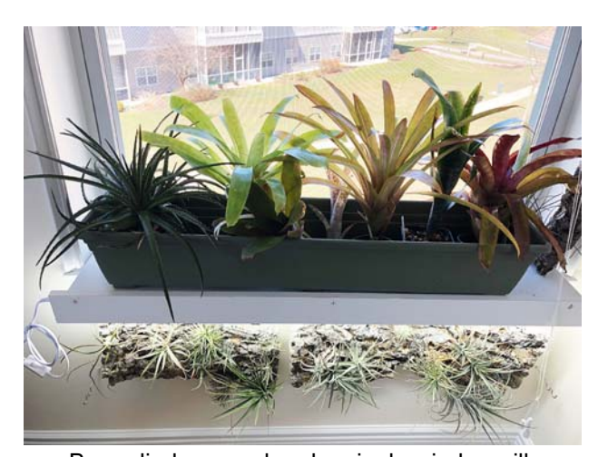
Bromeliads on and under single window sill.

When I see how well my broms are doing despite getting very limited water during the 8 months I was caring for my wife, I can appreciate how adaptable and tough they are. They were just semi-hibernating and now they are growing rejuvenated.