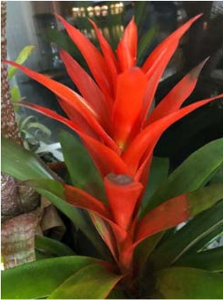
Guzmania 'Orangeade' in March