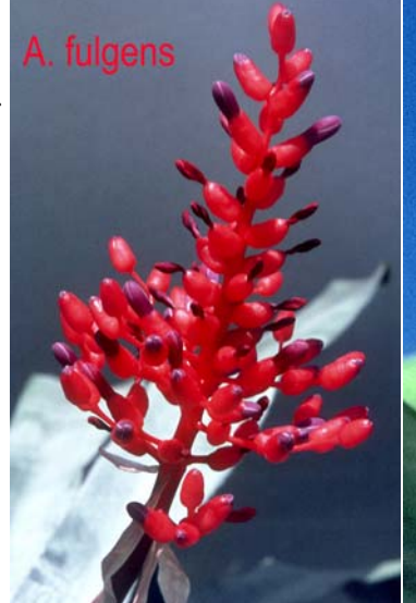
A. fulgens inflorescence

chantinii, A. zebrina and A. tessmannii are one and the same species. He also includes "A. amazonica" and "Pink Godess - Dark Godess chantinii", but these are merely clones of chantinii" (today we'd call them cultivars - Ed.), they have never been designated as species. He does the same with A. miniata and A. fulgens. Lumping these similar species or revising there keys could be readily rationalized if a study show that their taxonomic characters gradated across the species.